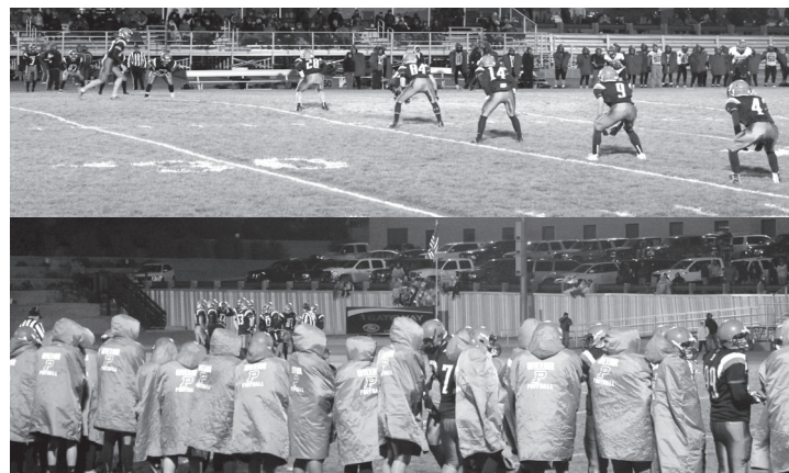
Photos from the playoff game against Brookings

the third time in five years. Before reaching the Dome, they will face Yankton, on Friday, November 3, in Pierre. The Govs have beat the Bucks in a previous meeting and hope to come out victorious once again.