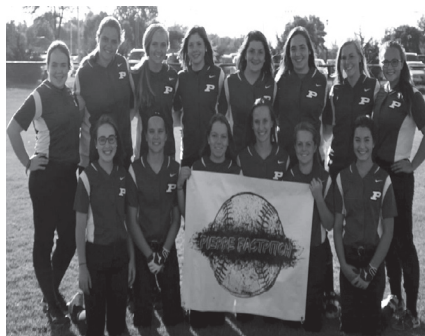
The Pierre Fastpitch Junior Varsity Team