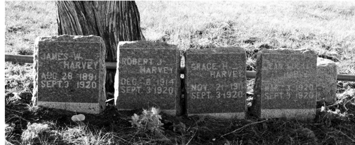
The names of four family members buried side by side at Cedar Hill Cemetery with the same death date.

This one was not as bad as it was hyped up to be, but it was one of the spookier experiences because we went when it was pitch black. We ended up going as a large group of about ten people, all equipped with safety glow sticks. As we began our journey into the woods, some kid lifted up the metal container that held the maps only to let it slam down with a loud CRASH!! Naturally, 90% of the group jumped with fright while 99% of the females in the group proceeded to scream. Alas, we continued Into the Woods. As we ventured on, we heard rustling that certainly was not us. We also heard ghouling sounds from beyond the woods. Periodically, the group would pause and tell their own spookiest tale. This was a slightly haunting in, since we were in a circle with our backs turned toward the unknown. After the tales were done, several members of the party claimed to see orbs, the haunted thing