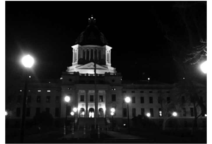
The Capitol building lit up at night

One of the more recent developments in Pierre, Abbey Road (and surrounding streets) is an area filled with