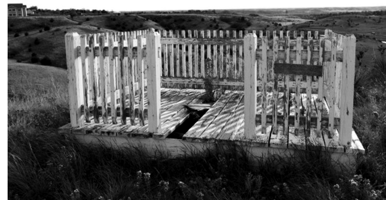
The abandoned white porch in the Abbey Road community