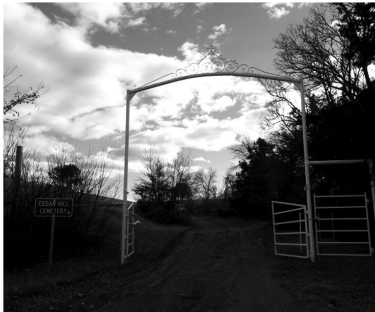
The entrance to Cedar Hill Cemetery

Although we only got the opportunity to visit 4 spooky locations in Pierre, there are a few more places said to be haunted, the most notable being the Capitol. It is said that if you wander the basement hallways after hours, you can hear the voices of some of the deceased Governors. If you ever get the chance to visit the Capitol at night, we highly suggest you do it. We also encourage you to explore other haunted locations in South Dakota. Happy Haunting!