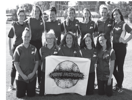
The Pierre Fastpitch Varsity Team